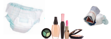
Diapers and personal hygiene products.